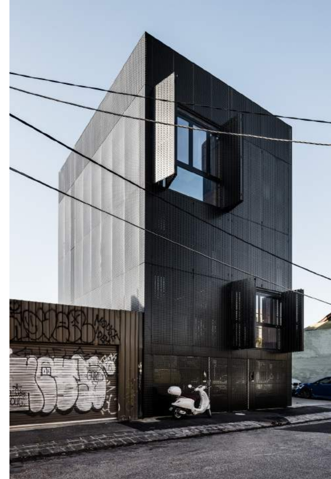
This page, clockwise from top The six-level building in inner-city Collingwood sits neatly within the confines of a 76sqm site. In the kitchen, MDF Italia chairs, Craighill 'Jack' puzzle on a Zanat 'Touch' tray and Moroso side table, all from Hub. Vases from Dinosaur Designs. Moroso sofa, Anta 'Afra' lamp and When Objects Work containers, all from Hub. Opposite page Landscape, New England artwork by Geoffrey Proud from Hub.