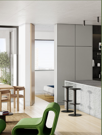
In collaboration with Hassell and DesignOffice, Otter Place exemplifies Milieu’s socially driven approach.