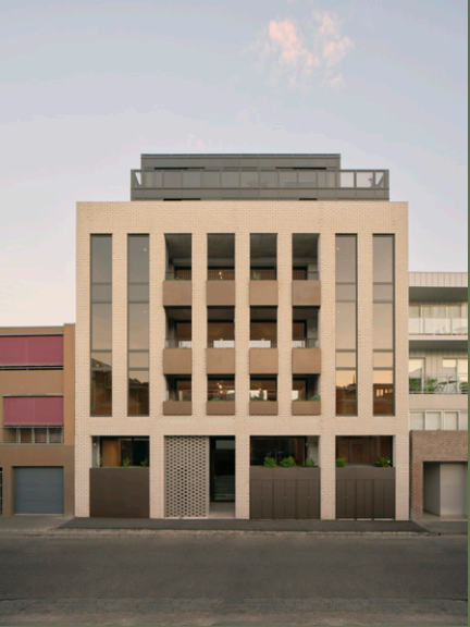
Milieu’s projects engage with their surrounds, giving rise to intelligent architecture and amenity in urban design.