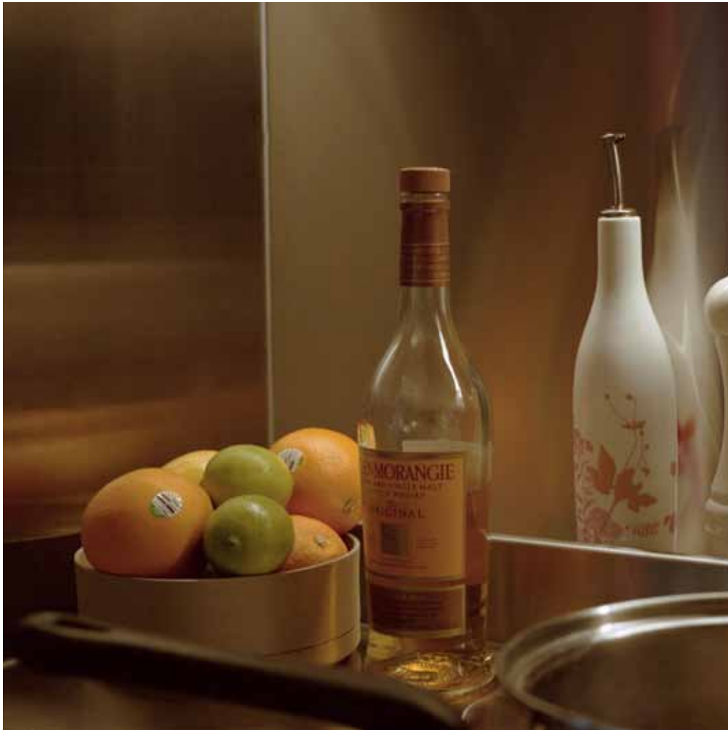
Stainless steel is a key material in the Peel By Milieu kitchens.