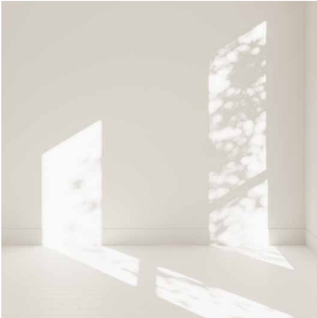
1 Natural light