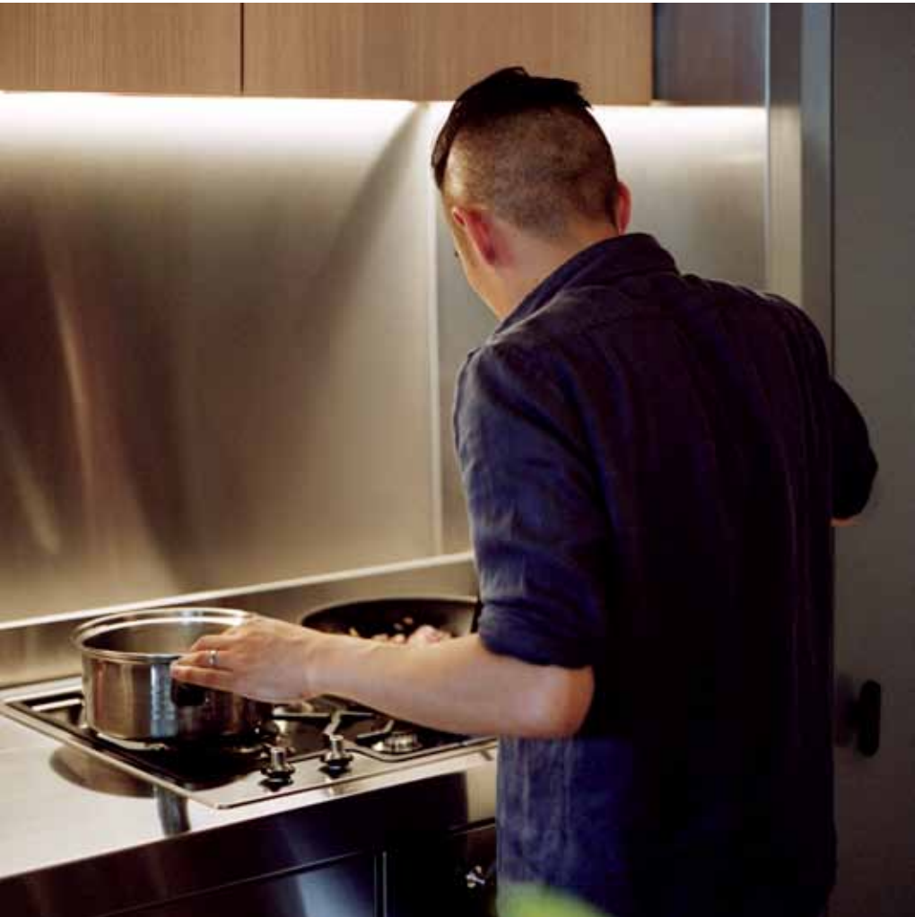
To Dean, the kitchen design was one of the apartments' most attractive features.