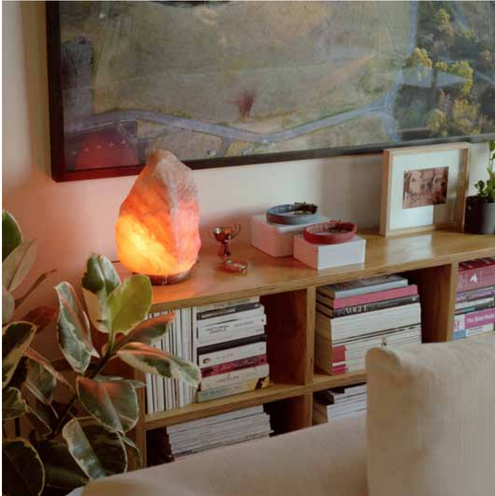
A living space is made from living.