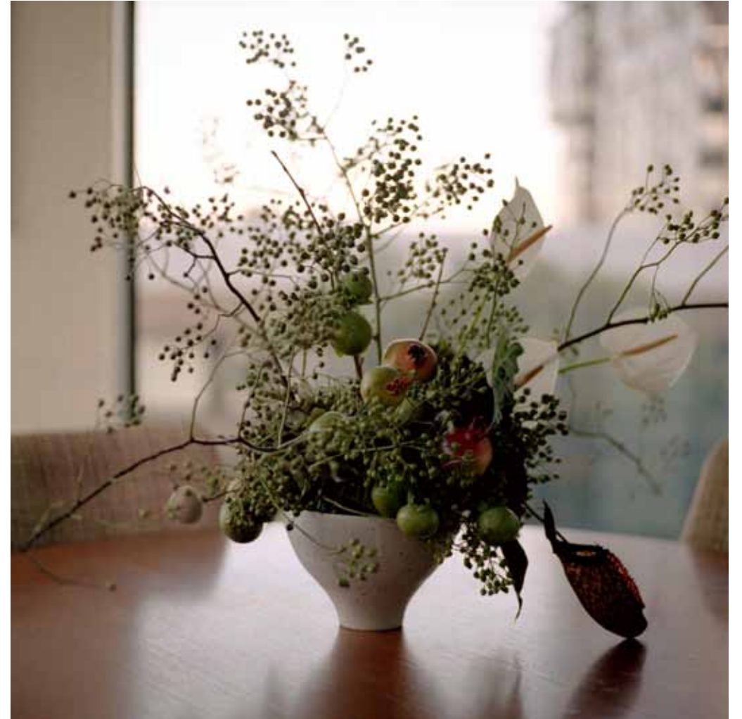
A seasonal arrangement adorns the living room table.