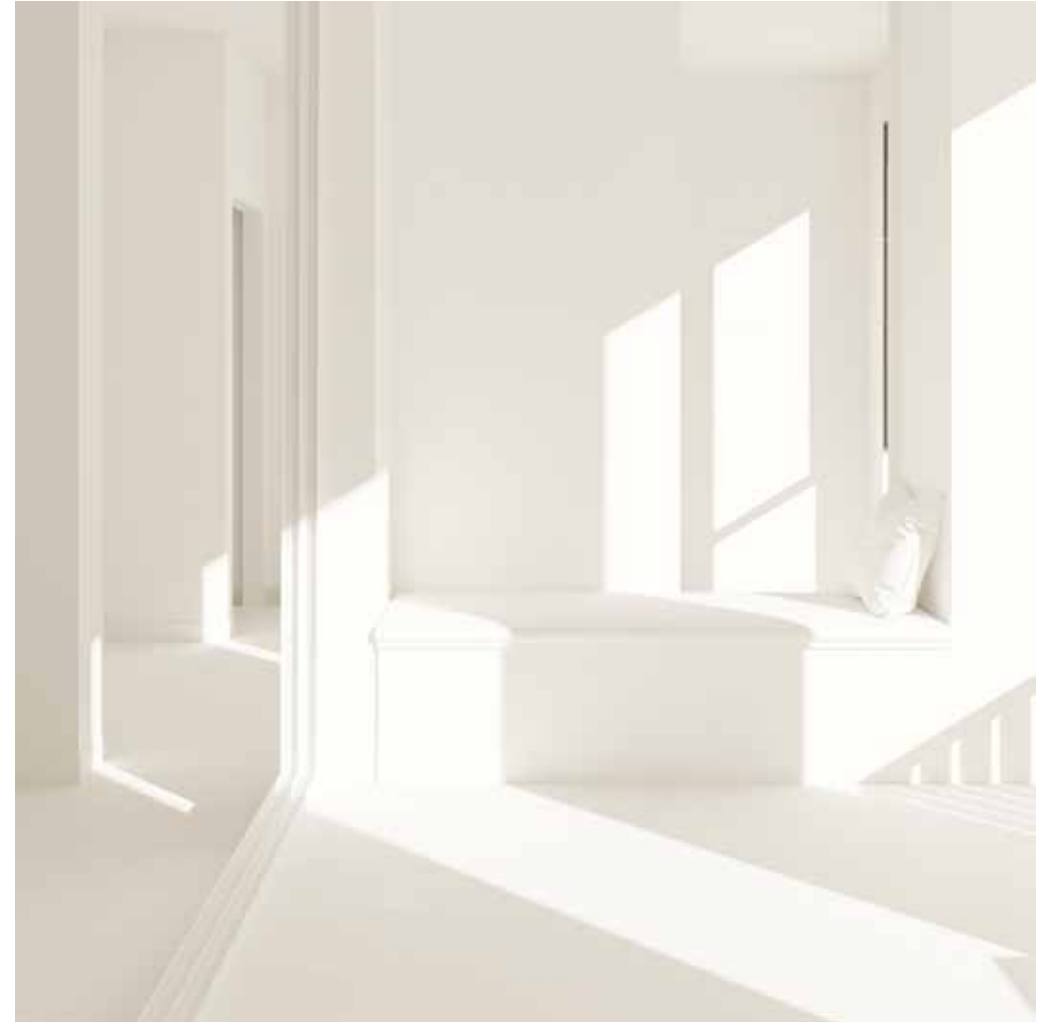
4 Window seat