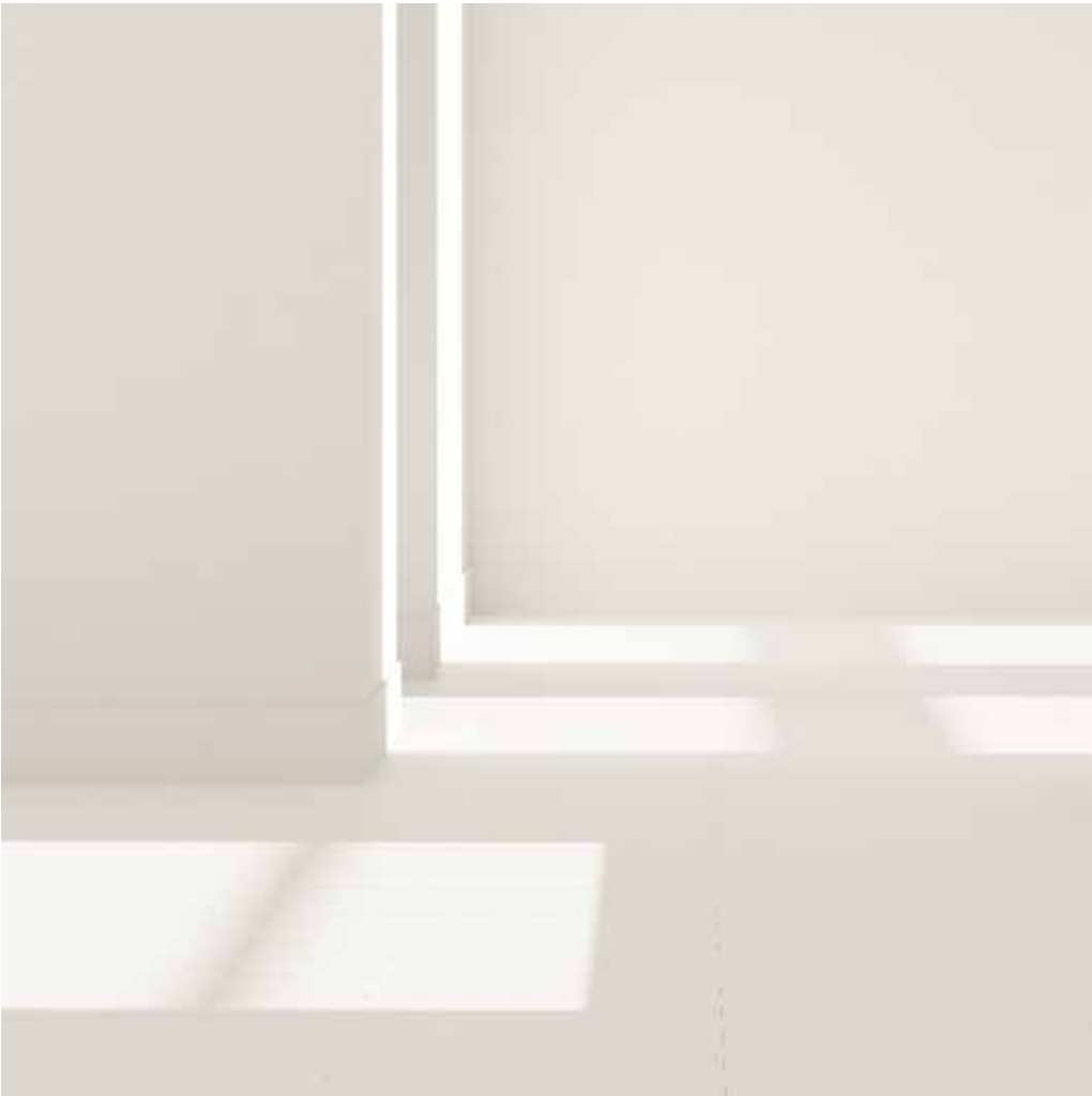
2 Shadows falling